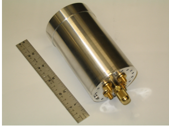
Figure 3: PMT enclosed with an aluminum hermetic case

minium shell. The thickness of scintillator was also changed from 10 mm to 12.7 mm as a compromise among material thickness, weight and performance.