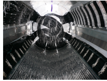
Figure 2: Layout of MTOF with both-end readout using fiber-bundled light guide

A new superconducting magnet was constructed for the BESS-Polar II flight while keeping basic features such as ultra thin material ( 2 \text{ g/cm}^2 per wall) [3]. The main improvement is its longer cryogen life, up to more than 22 days, compared with 11 days for the previous magnet. The longer life is achieved by installing a larger He reservoir